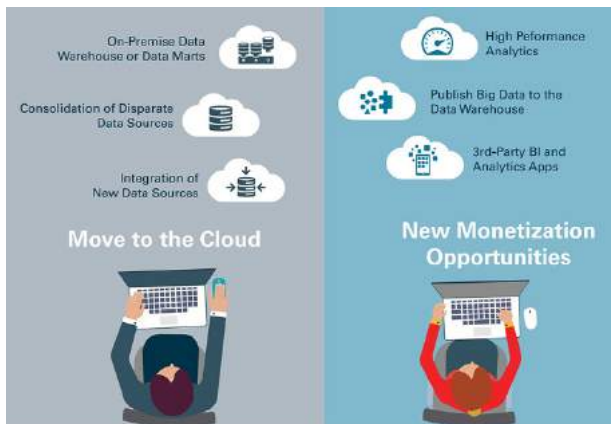
FIGURE 3-2: Common use cases enabled by Oracle ADW.

and database backups. More advanced monetization use cases include high-performance data management projects, data warehouses coupled with cloud computing analytics, and big data cloud implementation (see Figure 3-2).